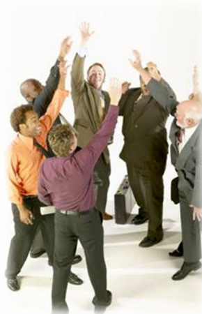
How Are You Boosting Staff Morale?